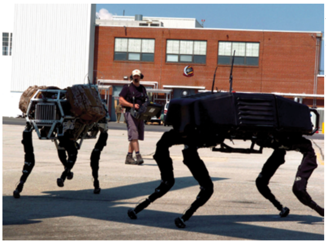
Military robotics, such as "Big Dog," may level the playing field for women in combat.

While such innovations will certainly help reduce the overall weight required to be carried by the individual soldier over the coming years, heavy loads will not be completely eliminated from a combat unit. Robotics, however, may change how the unit carries those loads.