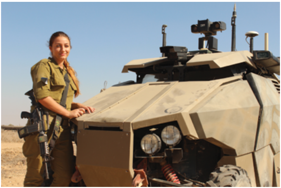
Israeli soldier with UVG.

To best utilize robotic and autonomous systems, a diverse set of warriors needs to be both on the battlefield implementing the technology and in positions of leadership to develop CONOPs and policy. Men and women need to be in the room when deciding ethical questions surrounding autonomous weapons