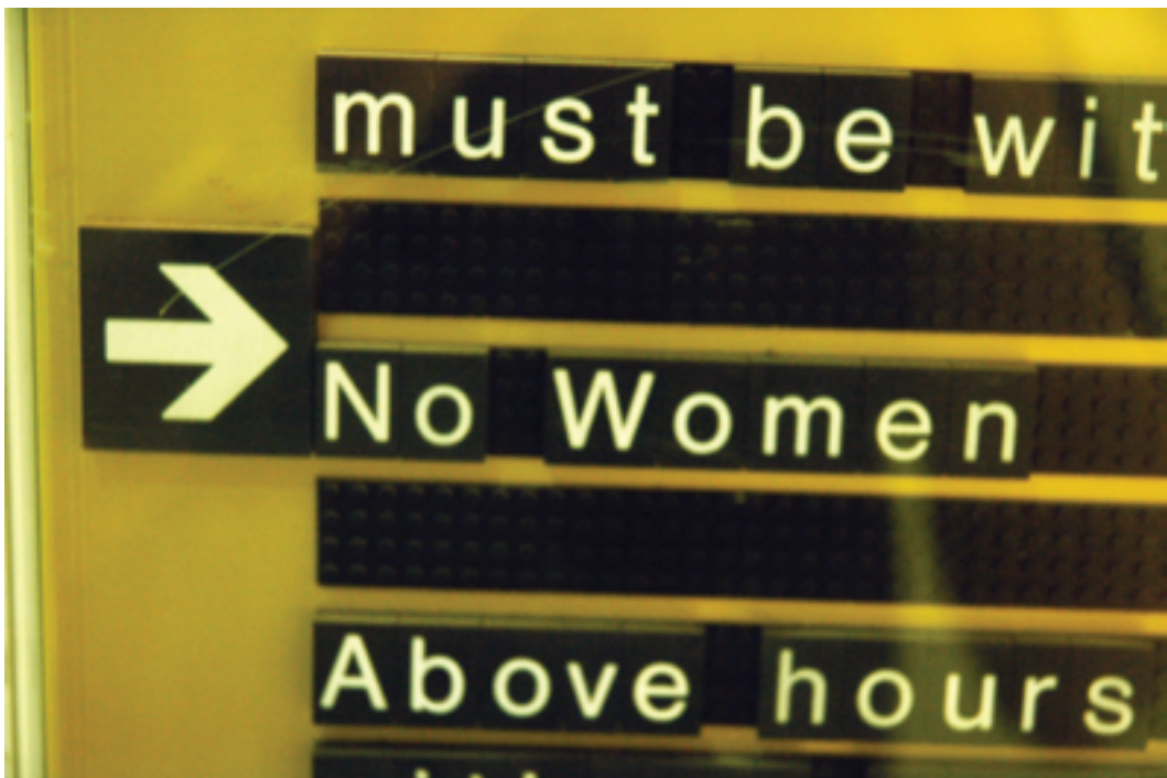
A sign in Jeddah, Saudi Arabia stipulates that women are not allowed to enter a hotel gym.

In all countries surveyed in these regions, roughly nine in ten say that wives must obey their husbands. This includes 94 percent of those polled in Afghanistan and 88 percent in both Pakistan and Bangladesh. Similarly, in all countries surveyed in the Middle East and North Africa, about three-quarters or more say the same, including 93 percent in Tunisia, 92 percent in Iraq, and 74 percent in Lebanon. The views of women are often not different from those of men even though the issue