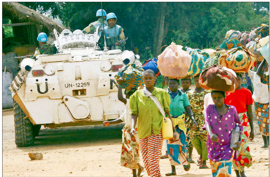
By communicating with local women, Joint Protection Teams have learned about local priorities, such as protecting people traveling to and from markets. A Bangladeshi patrol unit of the UN Mission in the Democratic Republic of the Congo keeps watch as villagers head to the market in Bogoro.

JPTs are small, ad-hoc teams of UN civilian, military, and police staff with diverse expertise that deploy to high-risk areas to generate recommendations for advancing protection of civilians and building confidence between the UN and local communities. JPTs were first officially fielded in early 2009 to formalize civil-military coordination, align specific investigations across mission sections, and prioritize increased and sustained peacekeeper contact with local communities. Following a pilot of JPTs in different environments, SRSG Alan Doss adopted the model across MONUSCO efforts in Eastern DRC. Senior mission leadership, including Deputy SRSG Leila Zerrougui, have continued to support them. As of