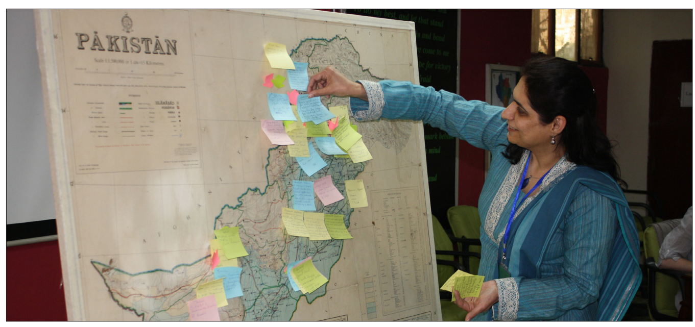
Coalition members map where they are from and where they work across the country.

worked with each other, came from diverse backgrounds, and were experiencing different kinds of conflict. During each trip to Pakistan, the Institute dedicated significant time for participants to get to know and increase trust in one another. At the workshops, participants often repeated that Pakistani women had never had a national platform for addressing issues related to extremism, peace, and conflict. The Women Moderating Extremism program was thus groundbreaking because it provided women an opportunity to unite around these issues. Just convening the group for four workshops was significant for participants because it allowed women who had previously been working in isolation in very insecure situations the chance to share their stories, meet other women facing similar dilemmas, and find allies in their fight against extremism.