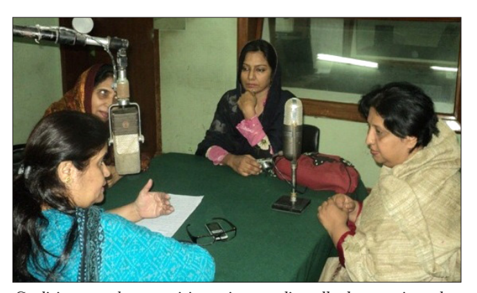
Coalition members participate in a radio talk show to introduce Amn-o-Nisa and discuss extremism's impact on their communities.