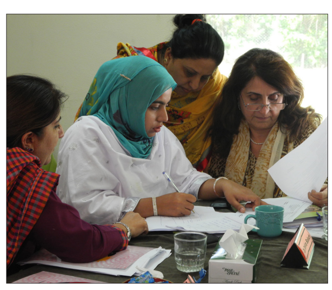
Coalition members from Punjab map key policies and stakeholders in their province to craft the group's advocacy platform.