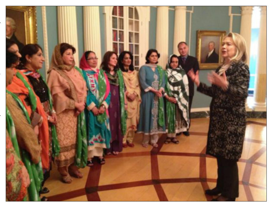
Secretary of State Hillary Clinton greets delegates from Amn-o-Nisa during a meeting in Washington, DC.

In April 2012, the program culminated in a delegation that exemplified the ultimate success and impact of the coalition's work. With funding from the US Embassy in Islamabad, 12 Amn-o-Nisa