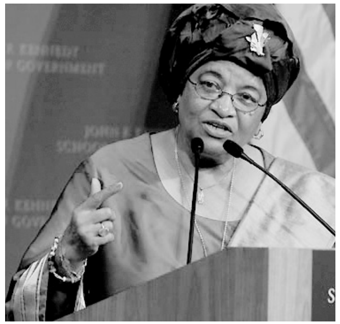
Africa's first democratically elected female president, Ellen Johnson Sirleaf (Liberia).